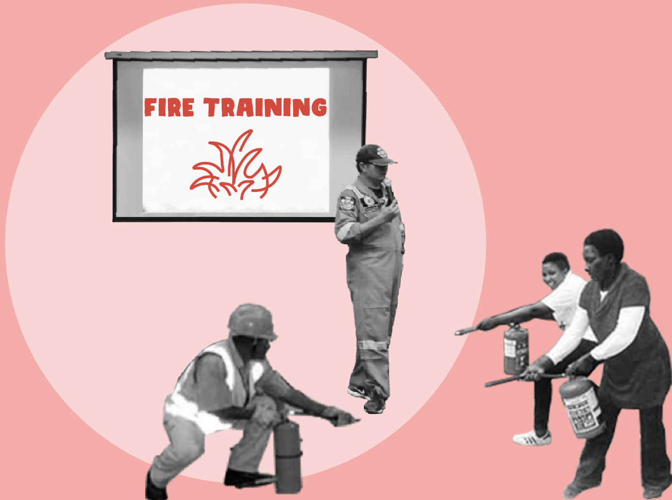
PROMOTE knowledge and awareness through campaigns on mitigating environmental disasters