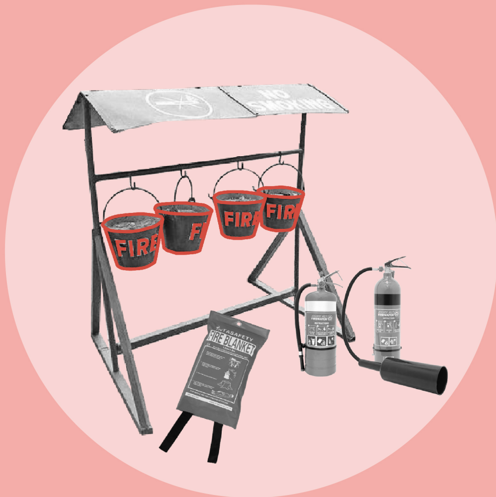
PROVIDE access to low-cost fire responses e.g. sand, buckets and fire blankets