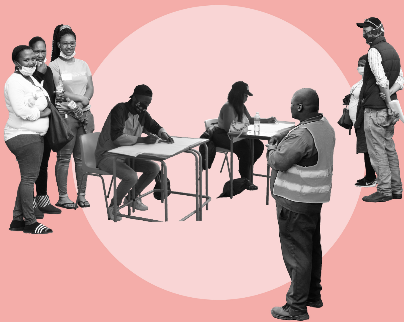
ENHANCE ACCESS to welfare, documentation, security and planning