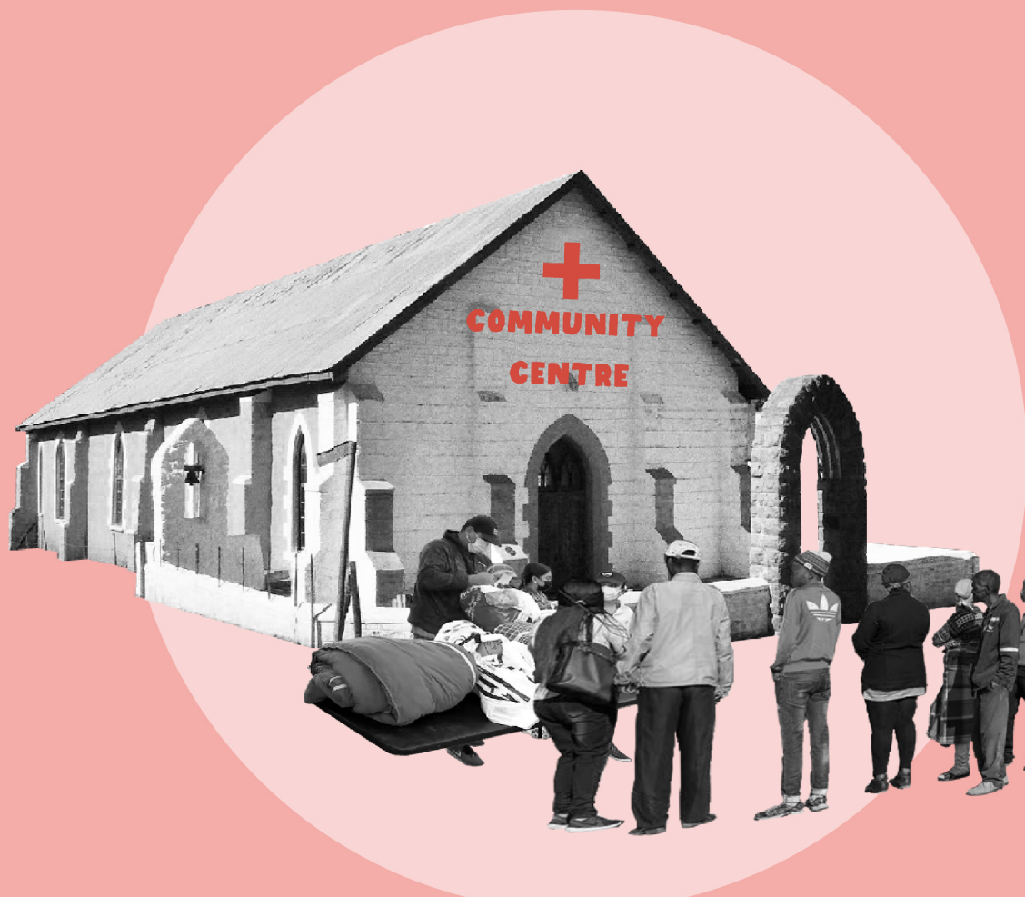
ALLOCATE open space and public institutions for emergency refuge