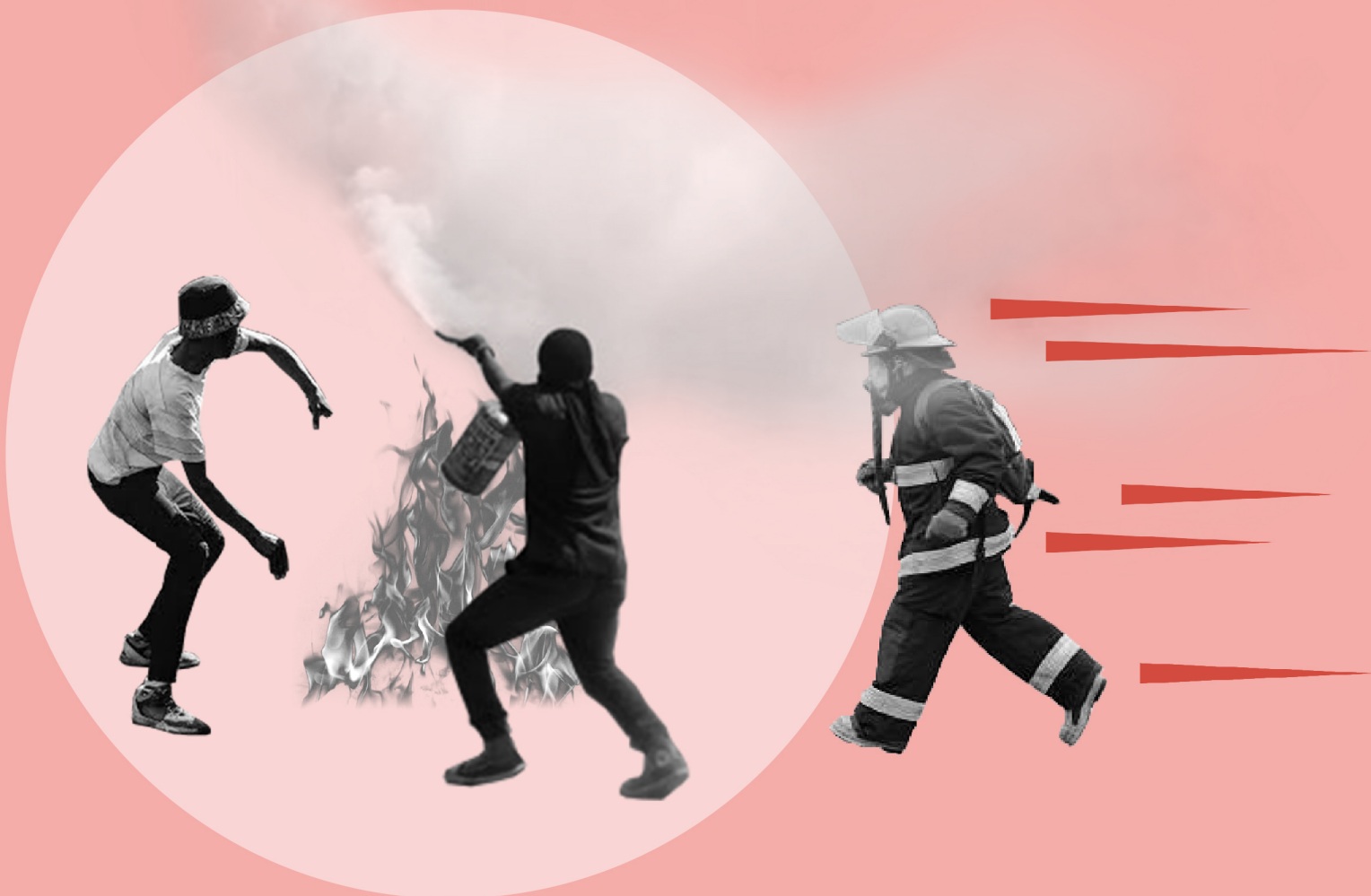
REFINE integrated ER strategies and household responses to fire