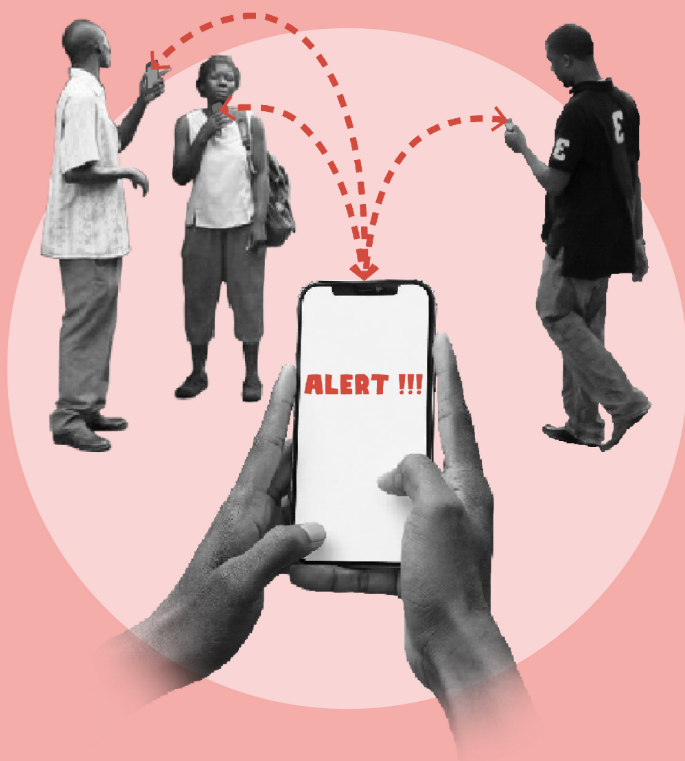
DEVELOP & DISSEMINATE social media response tools for public safety